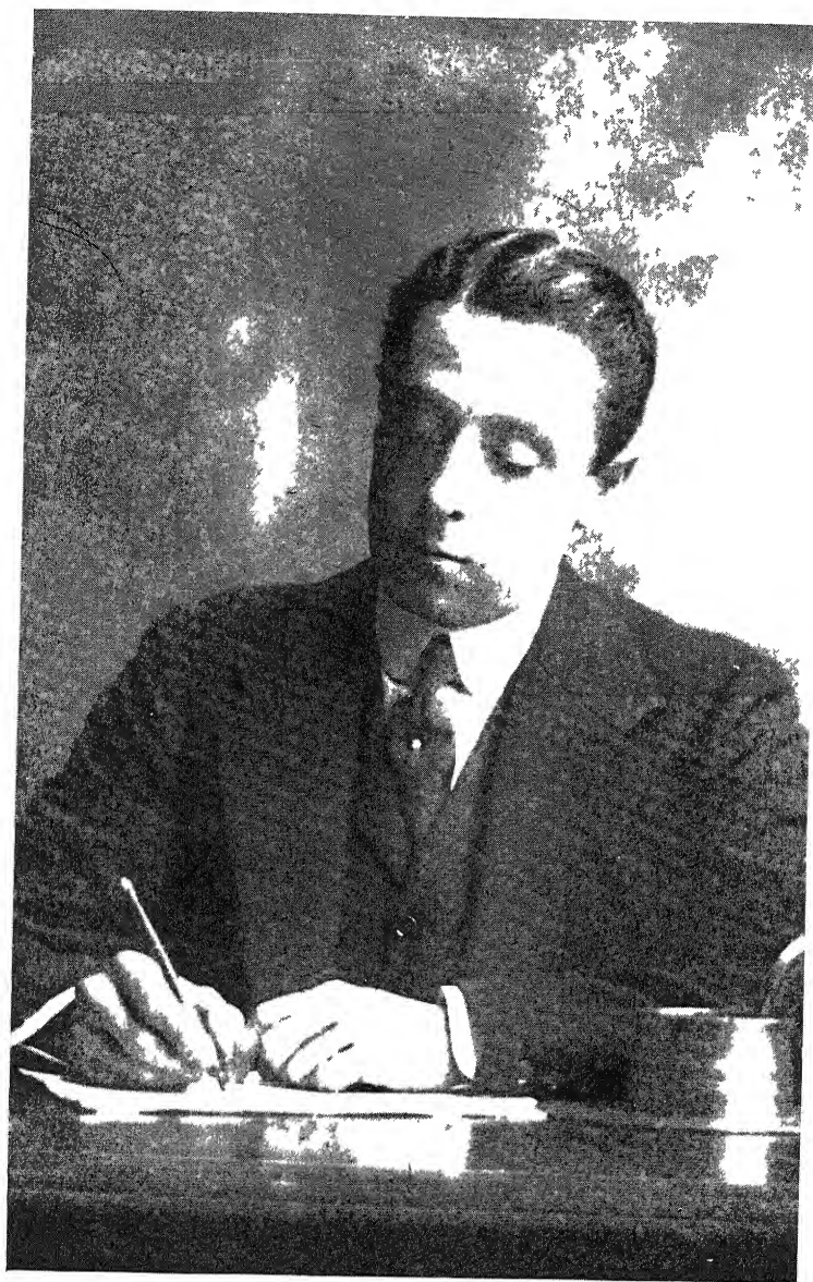
RUPERT D'OYLY CARTE